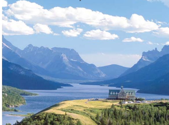
The Prince of Wales Lodge