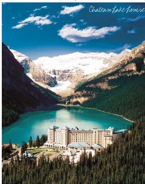
Chateau lake Louise

The Empire Builder arrives in St. Paul, Milwaukee and Chicago today and guests traveling to the West Coast arrive at 9am. Note: For guests that started their tour in California, return train travel from Portland back to any California points is included from Portland or Seattle. (Included meals are noted)